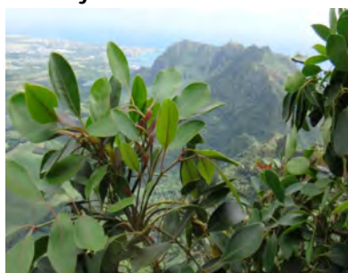
Tetbiss (new species)