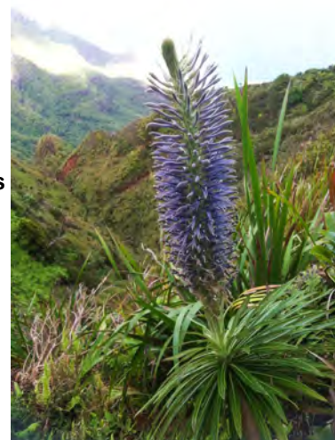
New species of Lobelia