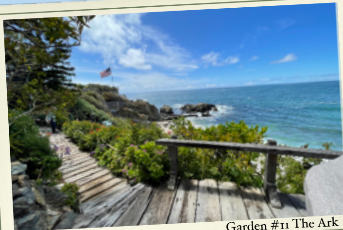
Garden #11 The Ark