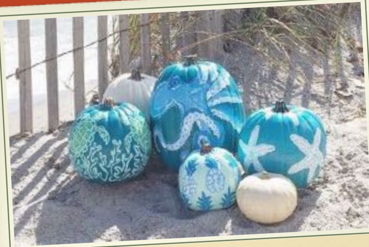
Education in the Garden