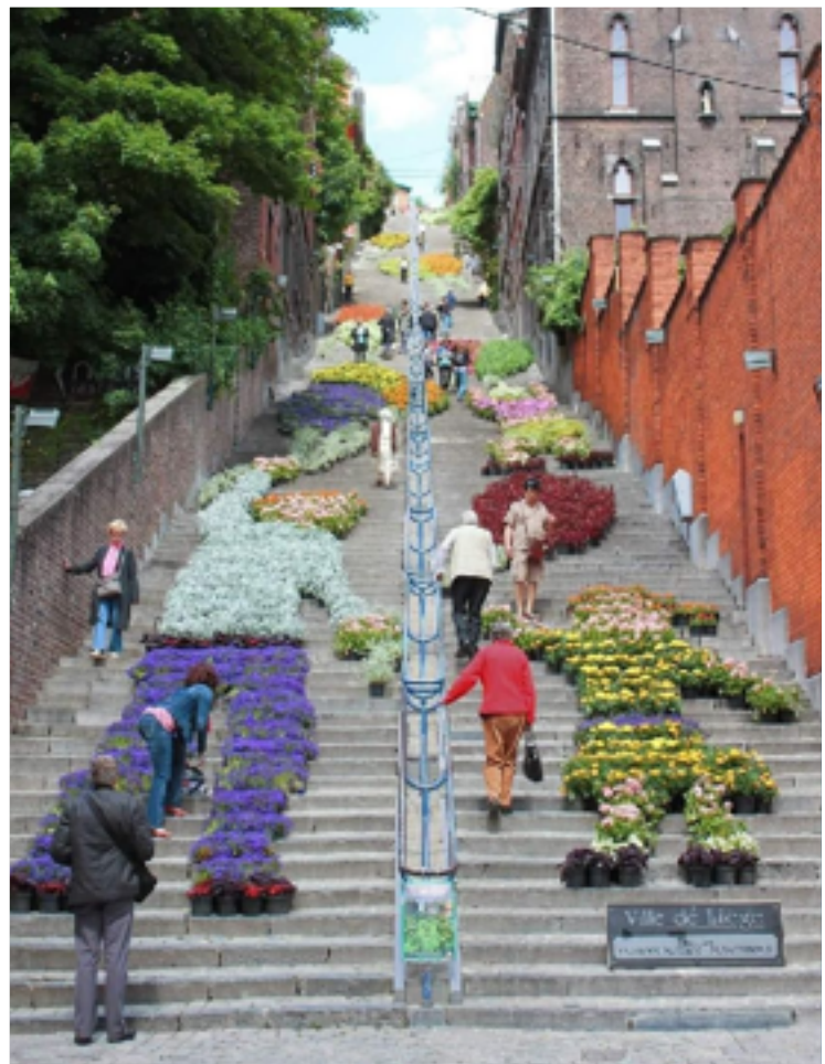
Beautiful potted plant installation up a 374-step staircase in Liège, Belgium.