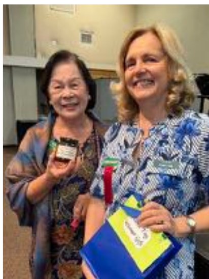
Name Tag Wearer