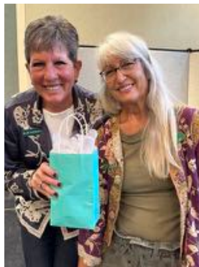
Volunteer of the Month